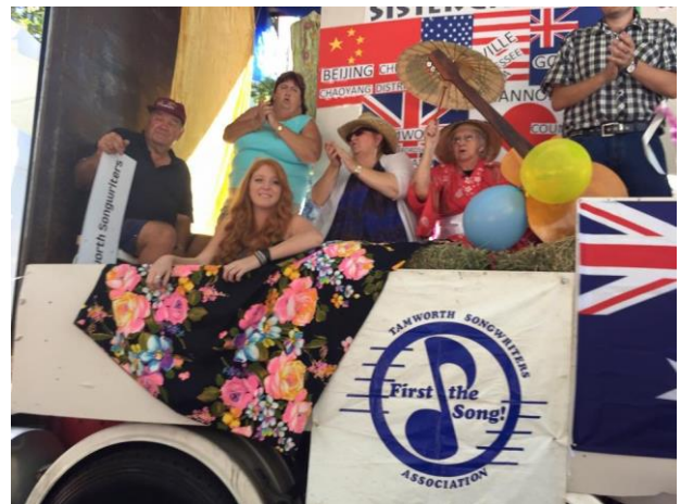
The TSA Float themed "Tamworth Country Music and a whole lot more"